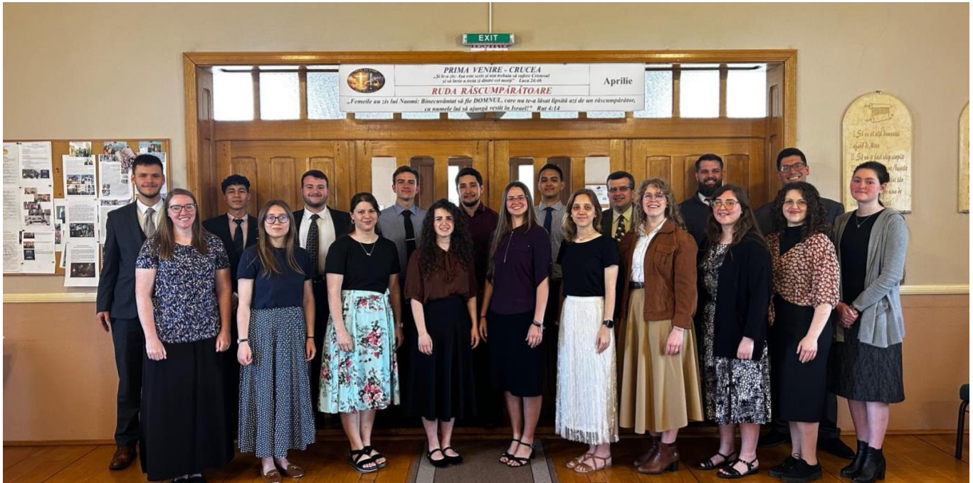
The Baptist College International Student Body and Staff (Spring 2026 Semester)