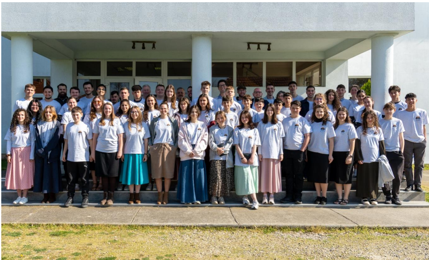
TBCI Youth Conference 2026