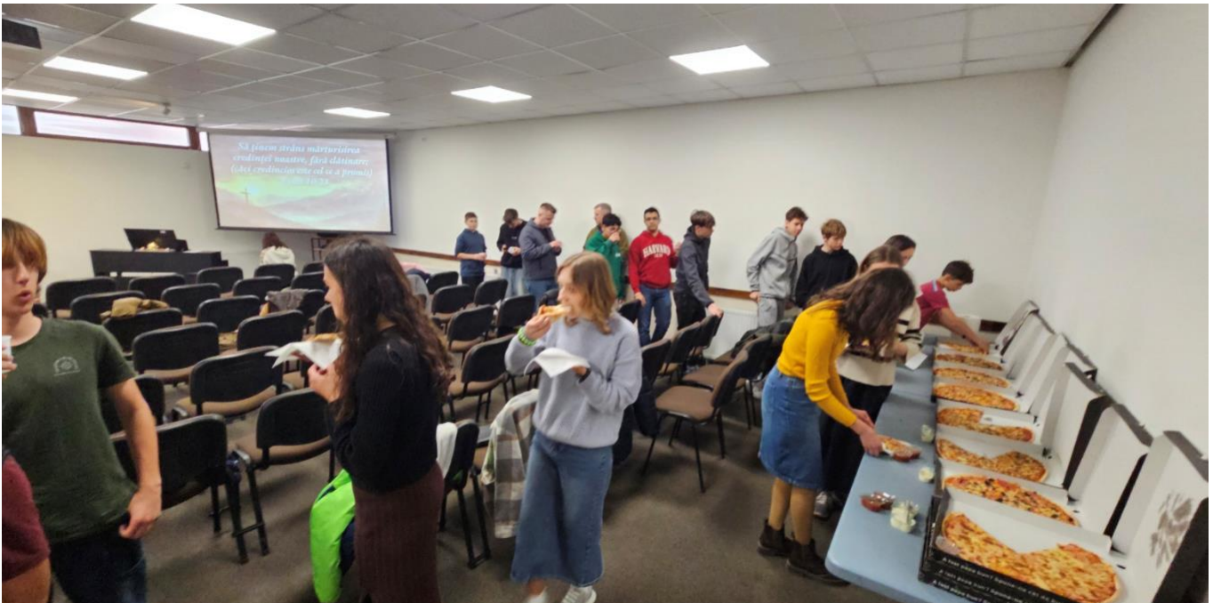
What would a youth activity be without pizza?