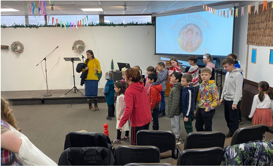
Christian Children's Club activity