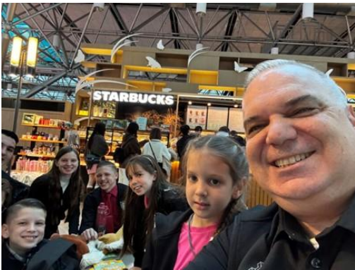
We are in Taiwan while in transit to the United States.