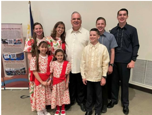
We dressed in Filipino attire for a conference.