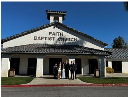
It's always a highlight when I can visit my home church, Faith Baptist Church, Wildomar, California.