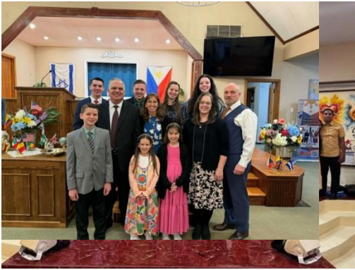
Here we are pictured at our Couples' Activity with the couples of our church that I have married.