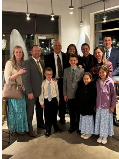
We were treated kindly by the folks at Grace Baptist Church, Colorado Springs, Colorado.