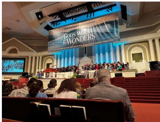
The Servants' Conference in Hammond, Indiana, was helpful and a blessing to be a part of.