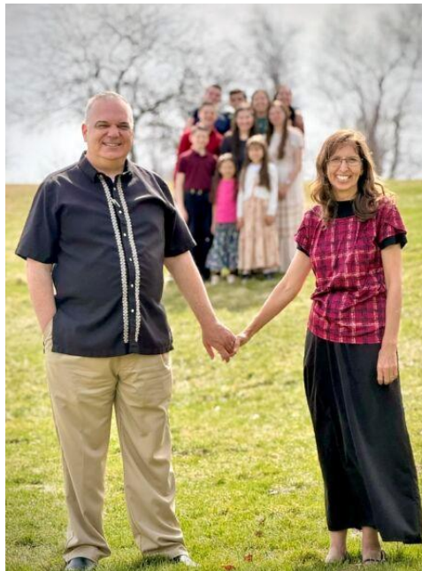
It was wonderful to have all of our children and grandchildren together in one place!