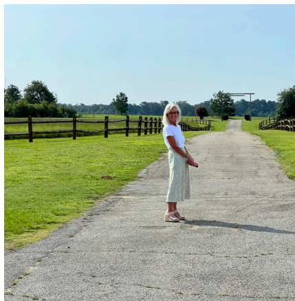
Ready for Sunday School and Church at the Red Barn