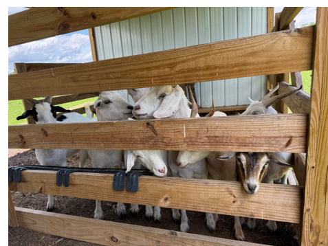
Brenda's girls waiting to be fed (spoiled).