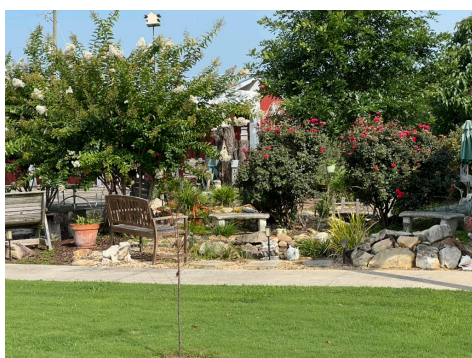
The garden is looking good. We've had lots of rain.