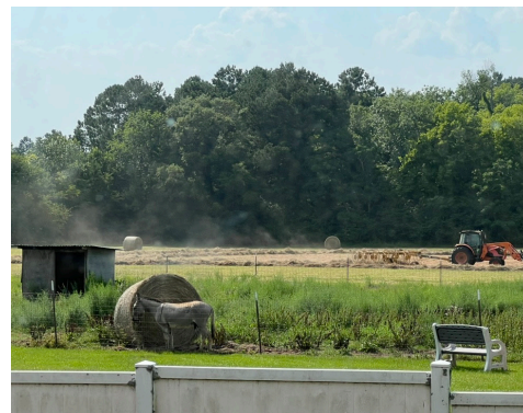
The farmers mowed last week and bailed 44 rolls of hay