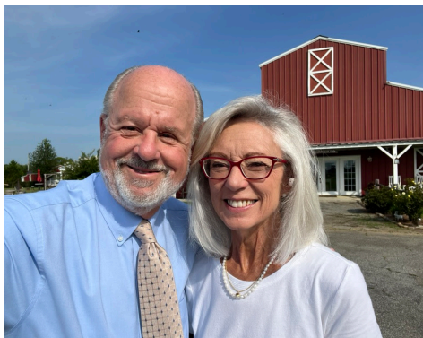
Squinting in the bright summer sunshine.