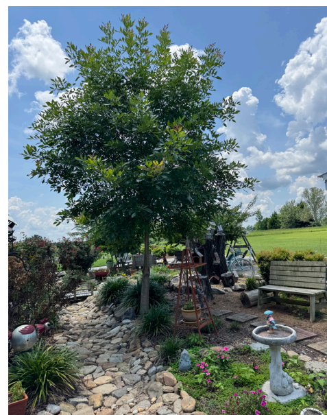
More of the garden