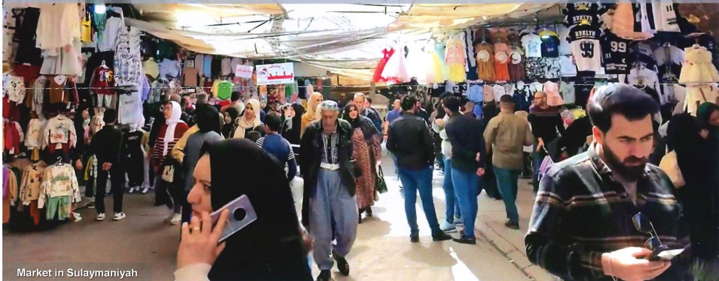
Market in Sulaymaniyah