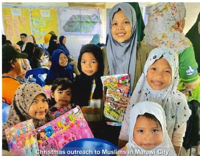
Christmas outreach to Muslims in Marawi City

Email: georgeazarris@yahoo.com (502) 817-1001