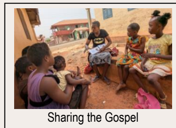
Sharing the Gospel

My visa had not come in time, so I had to delay my flight to Ghana; instead, it came the day after the scheduled flight . Because of this, instead of leaving on December 9, I left Bangor, Maine, on December 30 . During the waiting time, I was blessed to be part of all of the Christmas festivities at my home church. I am thankful for the extra time to spend with them and with my parents and relatives. I was also privileged to help with three Good News Clubs and their Christmas parties . It was wonderful to see many children come and hear the Christmas Story. I did fly out December 30, and it was a breeze.