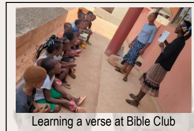
Learning a verse at Bible Club