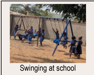
Swinging at school

A prayer request I asked was for people to pray that all nine of my suitcases would make it to Ghana. They did and came faster (seven went on the bus) than we thought. What a blessing! Thank you so much! I am still praying about how my storage stuff can come to Ghana. It is currently at my parents' house. Please pray that my parents and I have wisdom about how to get it here to Ghana.