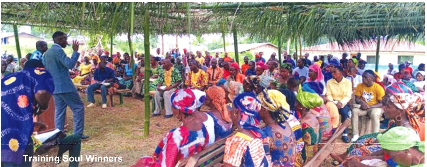
Training Soul Winners

$40,000 has been given to build the Tappita station. $35,000 is still needed.