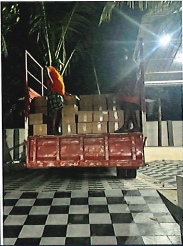
Telugu Scriptures for the People of India