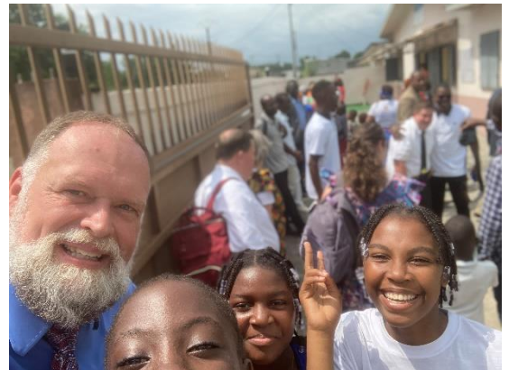
Team from the United States

“Therefore, my beloved brethren, be ye steadfast, unmoveable, always abounding in the work of the Lord, forasmuch as ye know that your labour is not in vain in the Lord.” (1 Corinthians 15:58)