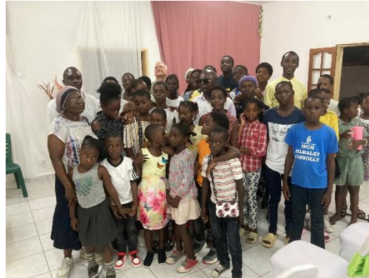
Children and Youth