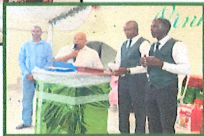
Community Officials attended our celebration of Jesus